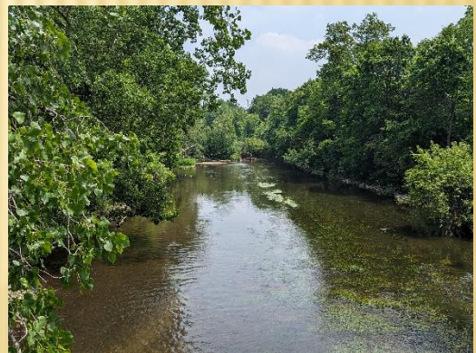
The Thornapple River as it flows through downtown Hastings