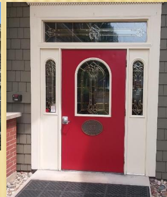
Top left: The Rectory