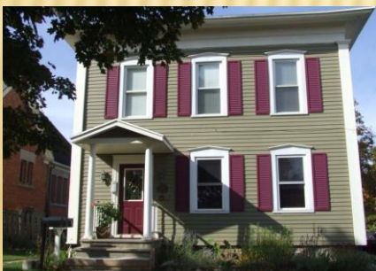
Bottom left: Emmanuel House