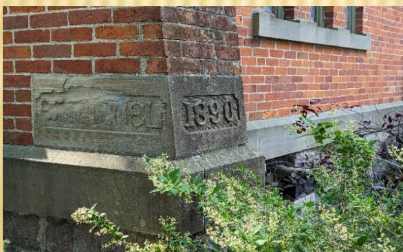
Bottom left: Emmanuel's cornerstone