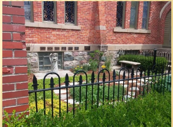
Above: Memorial Garden