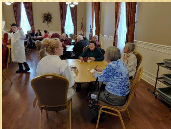
Youth Group members leading an activity

We have created a welcoming space in the Nave for young children. There is a unified goal from the Parish assessment to grow and attract young families to Emmanuel. In 2023 we hired a Director for Youth Ministry and are now able to offer Sunday School on a regular basis, along with Vacation Bible School in the summer.