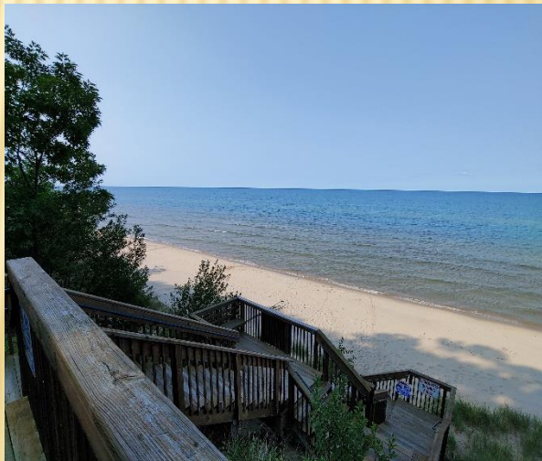
Lake Michigan, within an hour's drive