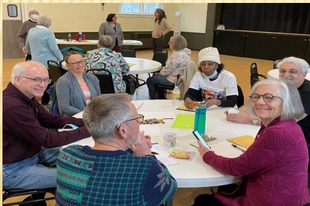
Sacred Ground meeting

Emmanuel hosted a 10-session Sacred Ground Dialogue Circle via Zoom in 2020-21. This interactive study had been piloted by the Dismantling Racism Task Force of the Diocese. The group was comprised of nine Emmanuel parishioners and three participants from other Hastings churches. The group grew into a new entity “ Roundtable Companions for Racial Equity .”