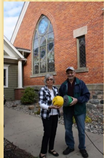
Left: Commissioning Ceremony for the Solar Array installation